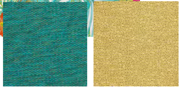
JIM THOMPSON CUSTOMISED HIGH PERFORMANCE FABRICS, ARE PERFECTLY SUITED FOR THE ECO-FRIENDLY INTERIORS AT ANDAMAN BAY VIEW RESIDENCES

Hand-woven textiles and decadent wall-coverings that adorn Andaman Bay View Residences are produced by world reknown Jim Thompson who has been recognised globally as a treasured name in Thai silk production, and who's clients include some of the world's foremost interior designers and architects.